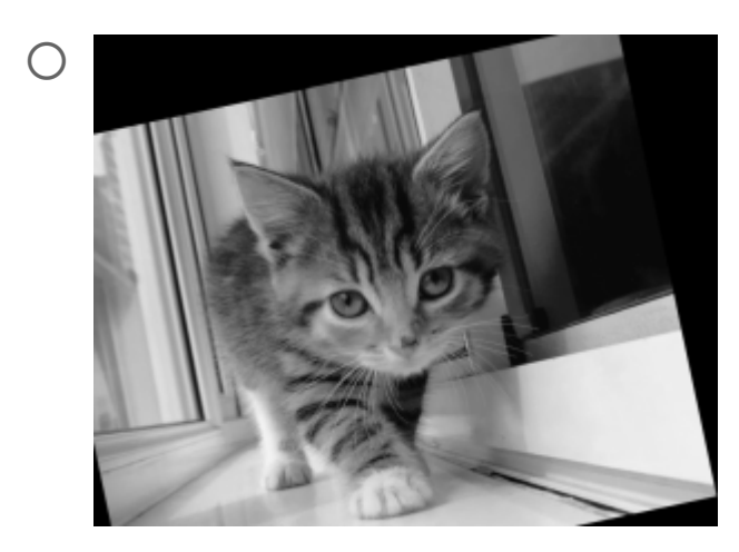
O Do not know